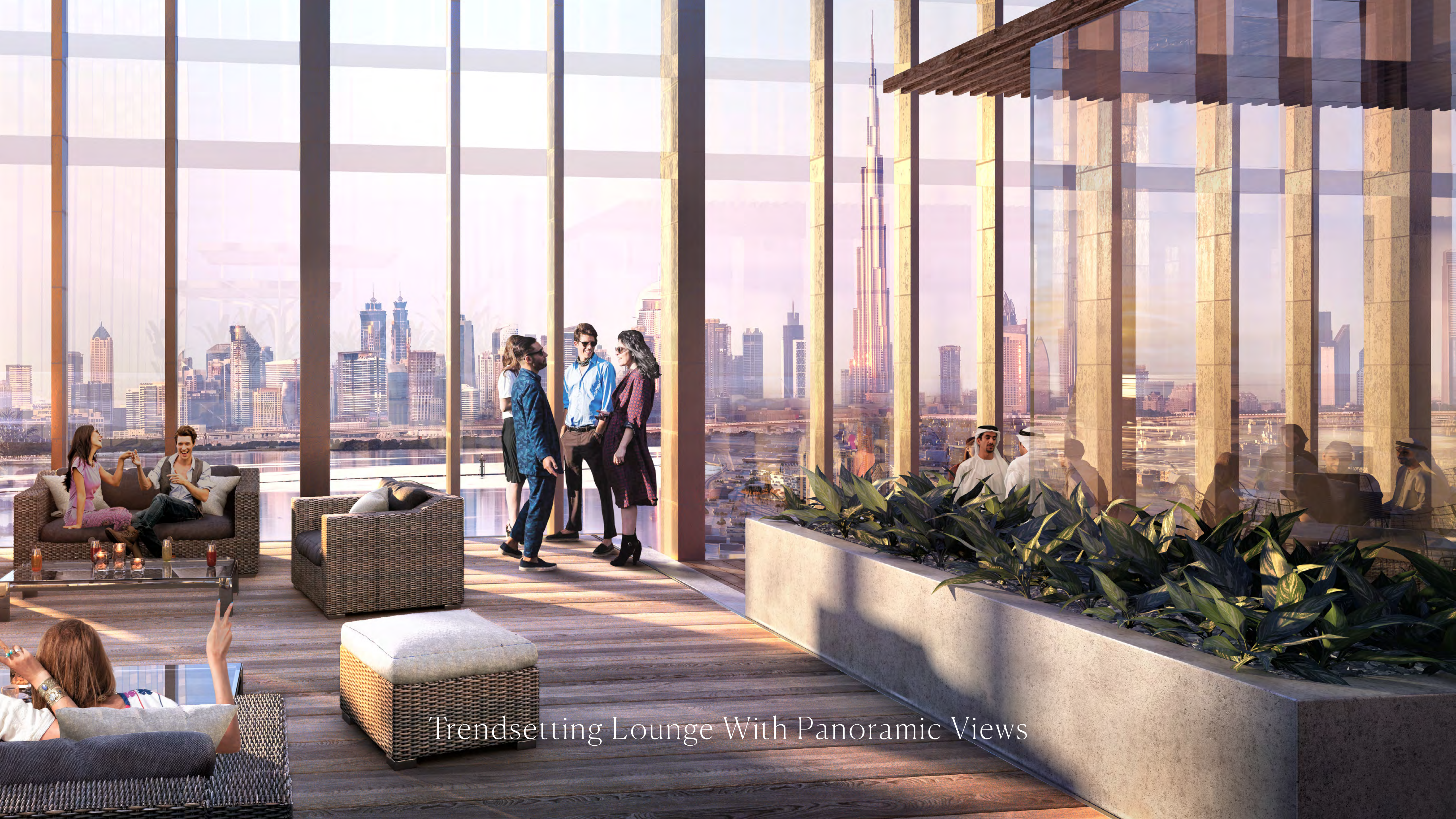
Trendsetting Lounge With Panoramic Views