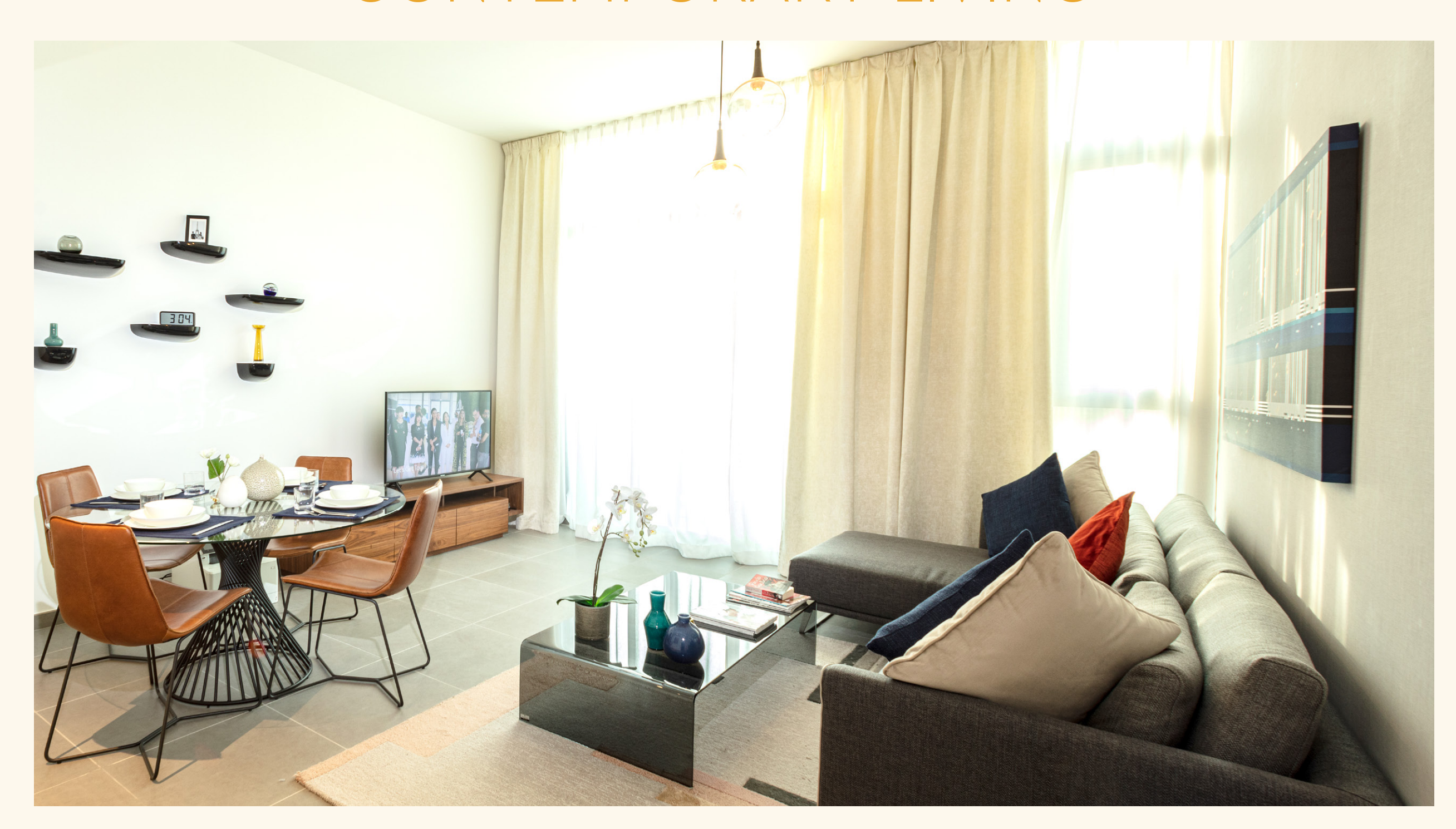
THOUGHTFULLY DESIGNED SPACES