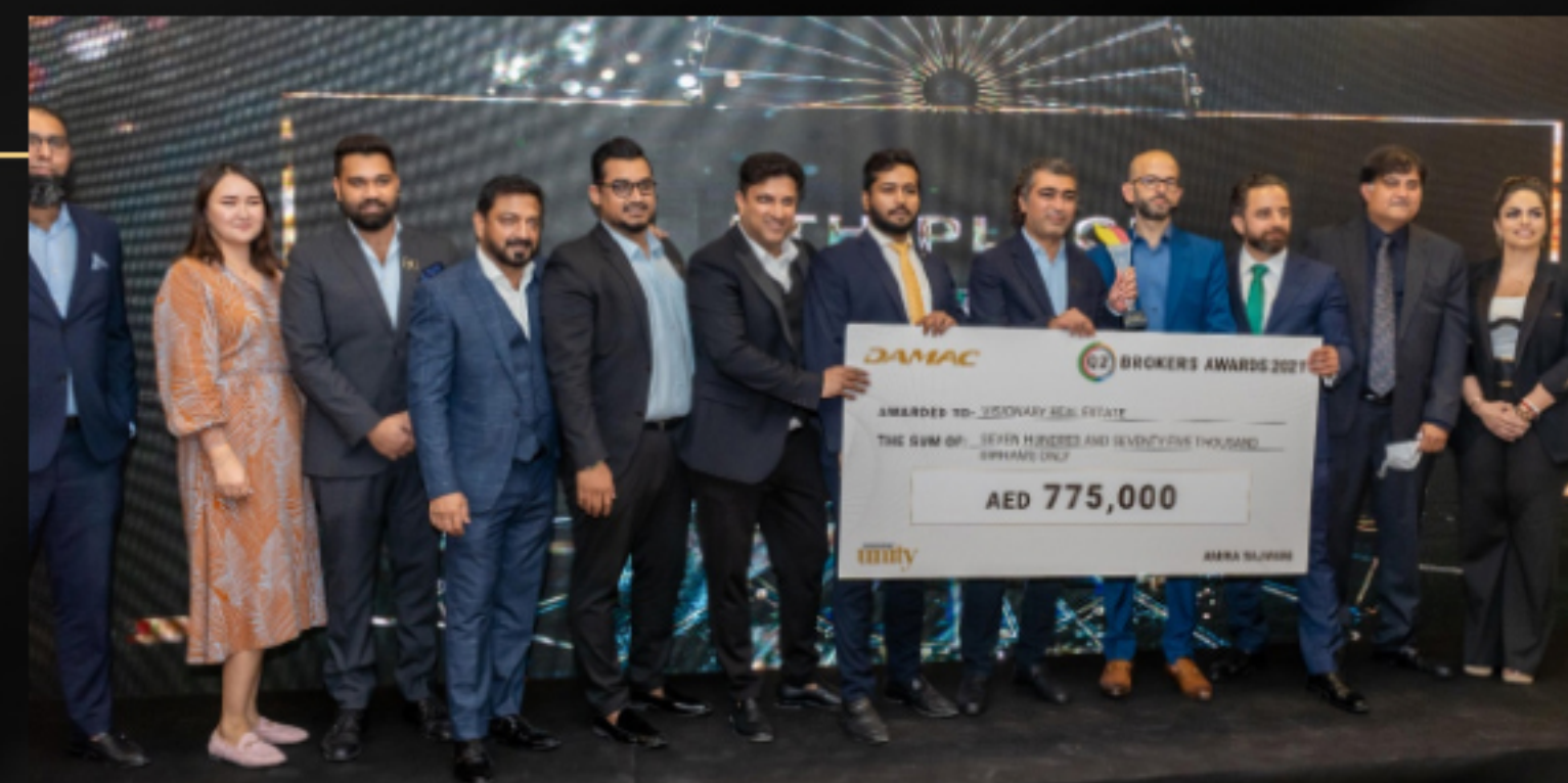
DAMAC Q2 BROKER AWARD 2021