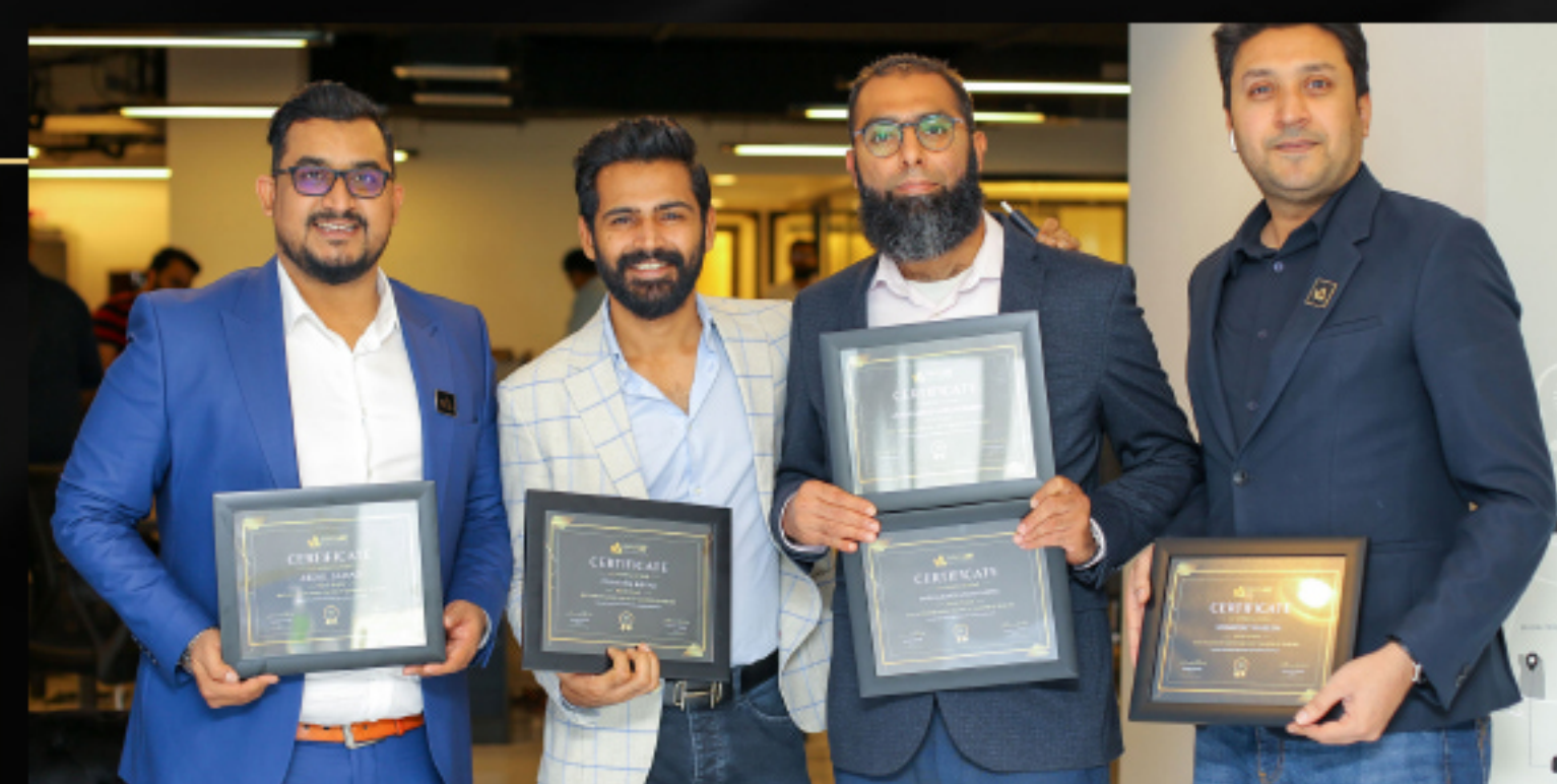
VISIONARY Q2 AWARDS 2021