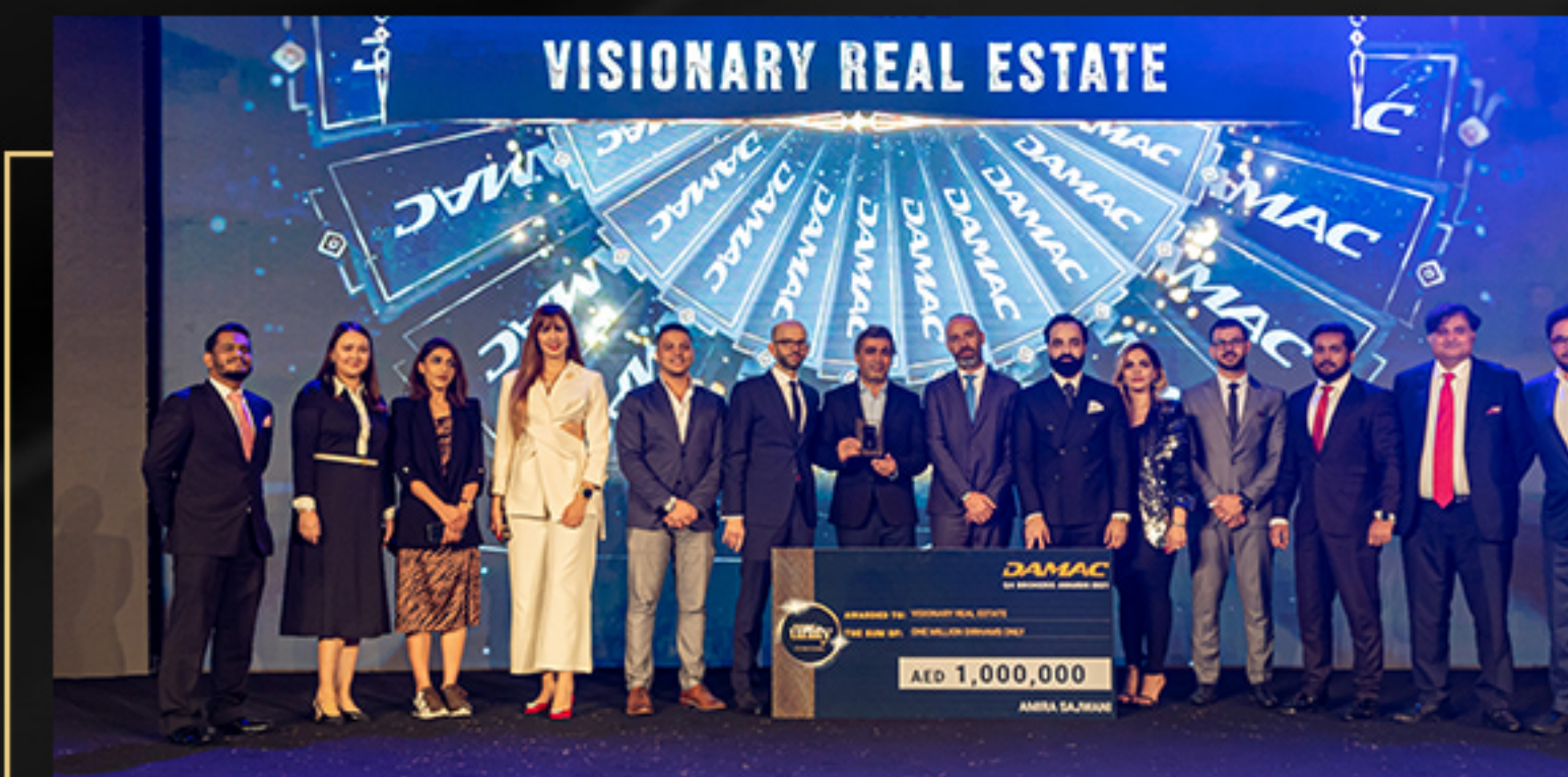
DAMAC Q4 BROKER AWARD 2021