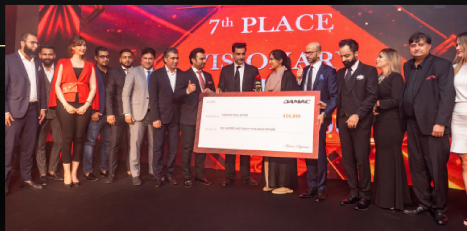
DAMAC Q1 BROKER AWARD 2021