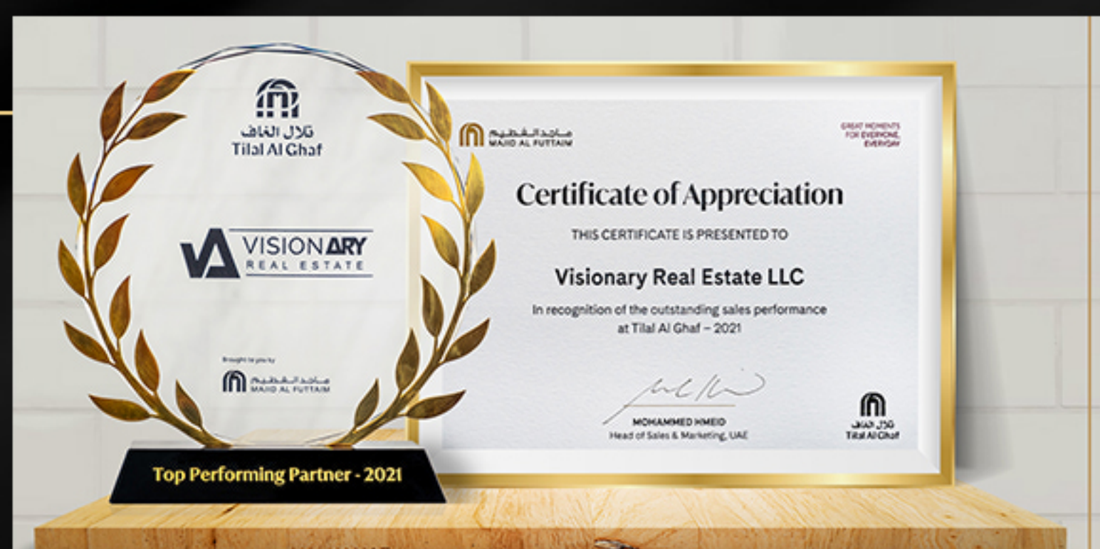
TOP PERFORMING PARTNER - TILAL