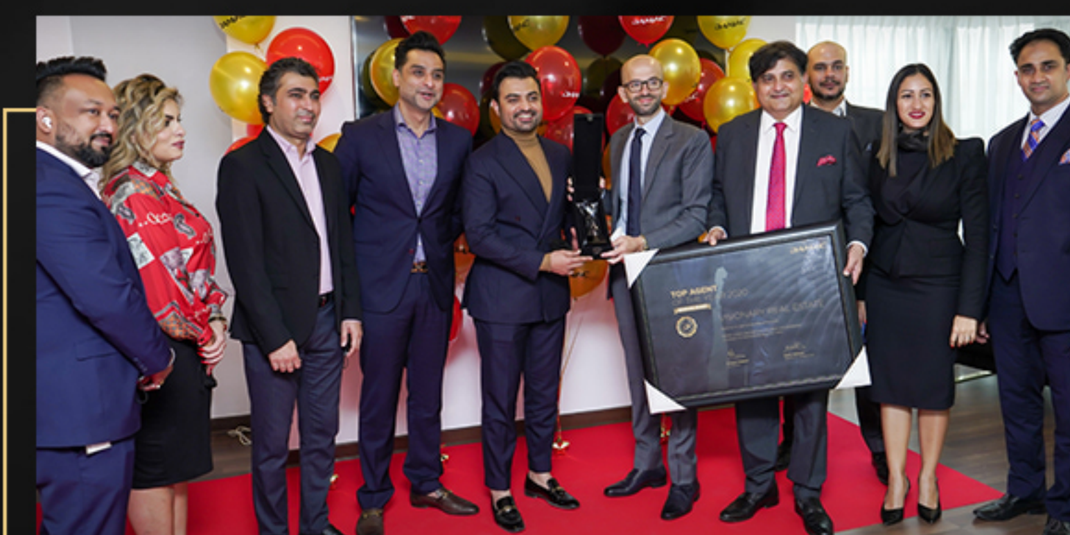
DAMAC TOP AGENT AWARD 2020