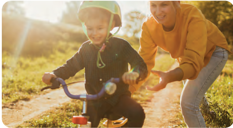
4.5 km of pedestrian tracks and 5.2 km of cycling trails