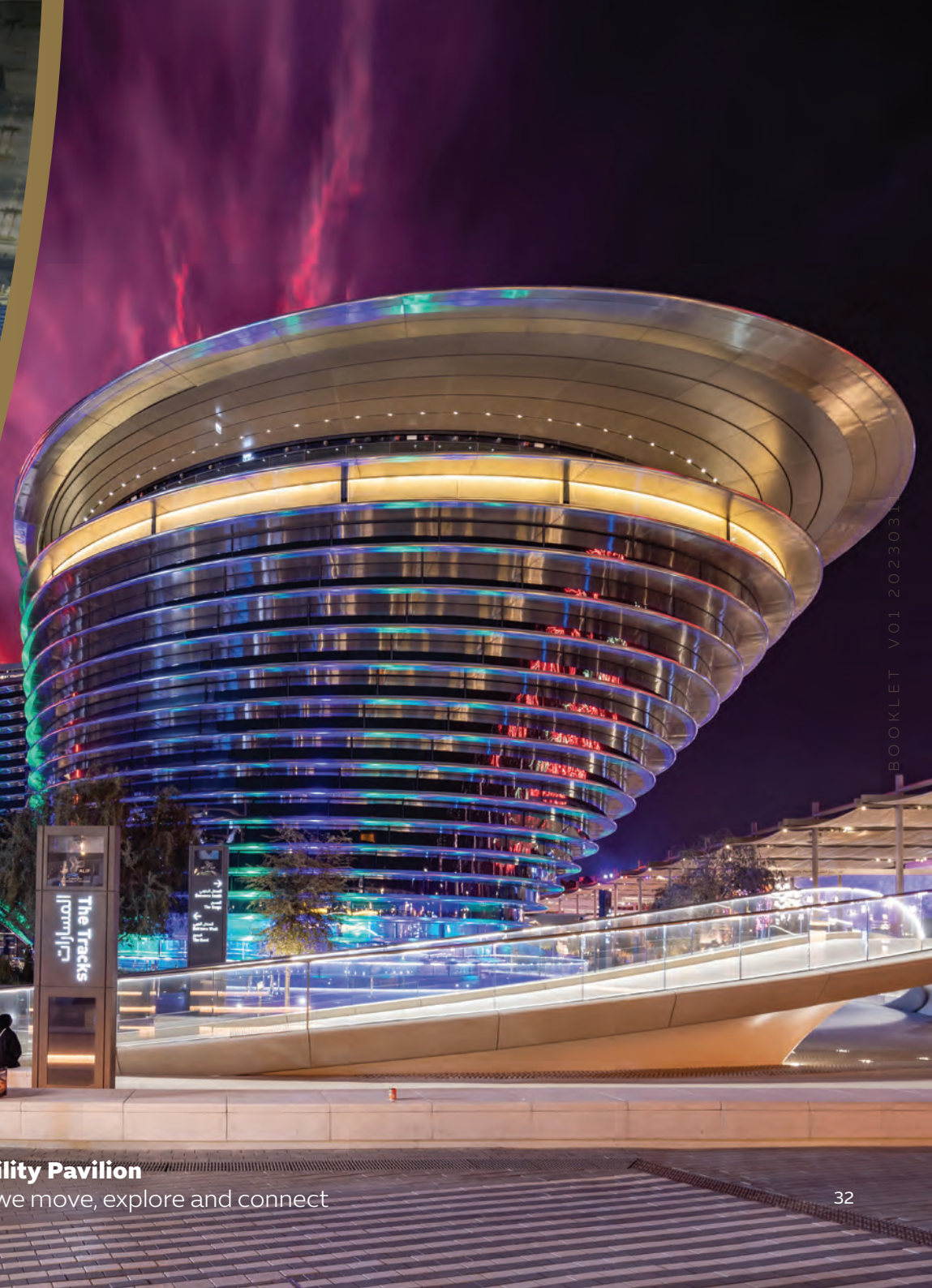
Alif – The Mobility Pavilion Exploring how we move, explore and connect