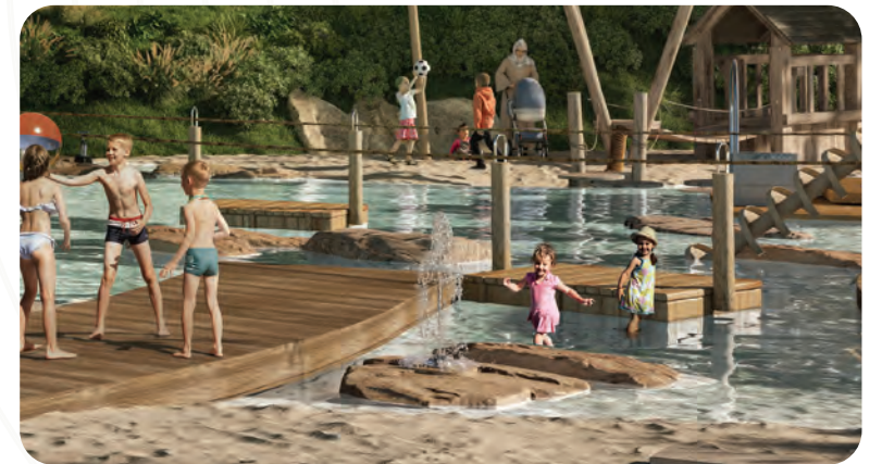
Swimming pools, splash pads and kids' play areas