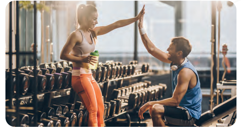
Gyms, outdoor wellness and fitness areas