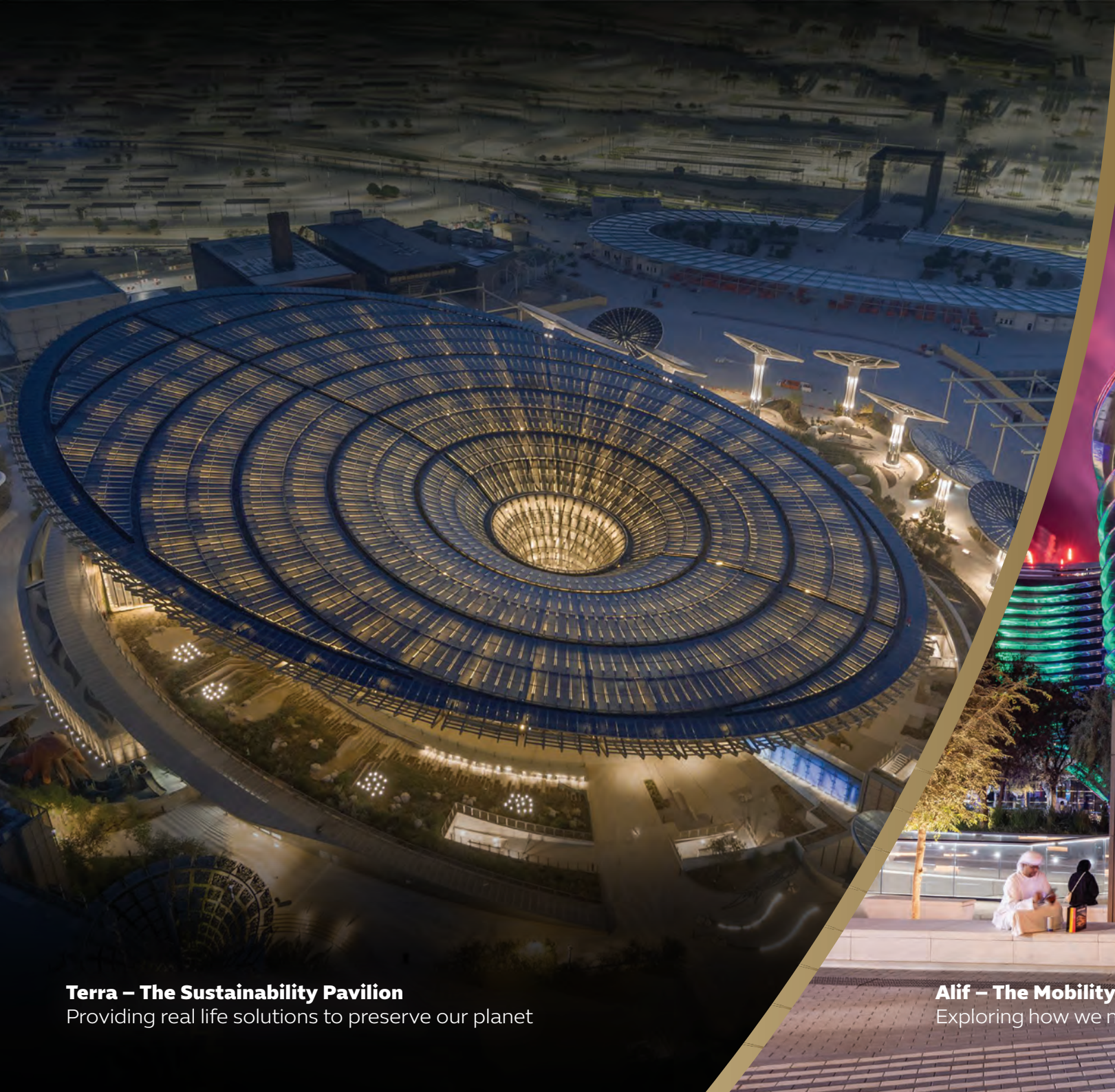
Terra – The Sustainability Pavilion Providing real life solutions to preserve our planet