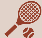
Padel Tennis Court