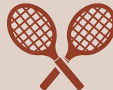
Squash & Tennis Court