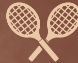
Squash & Tennis Court