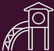
Kids Play Areas