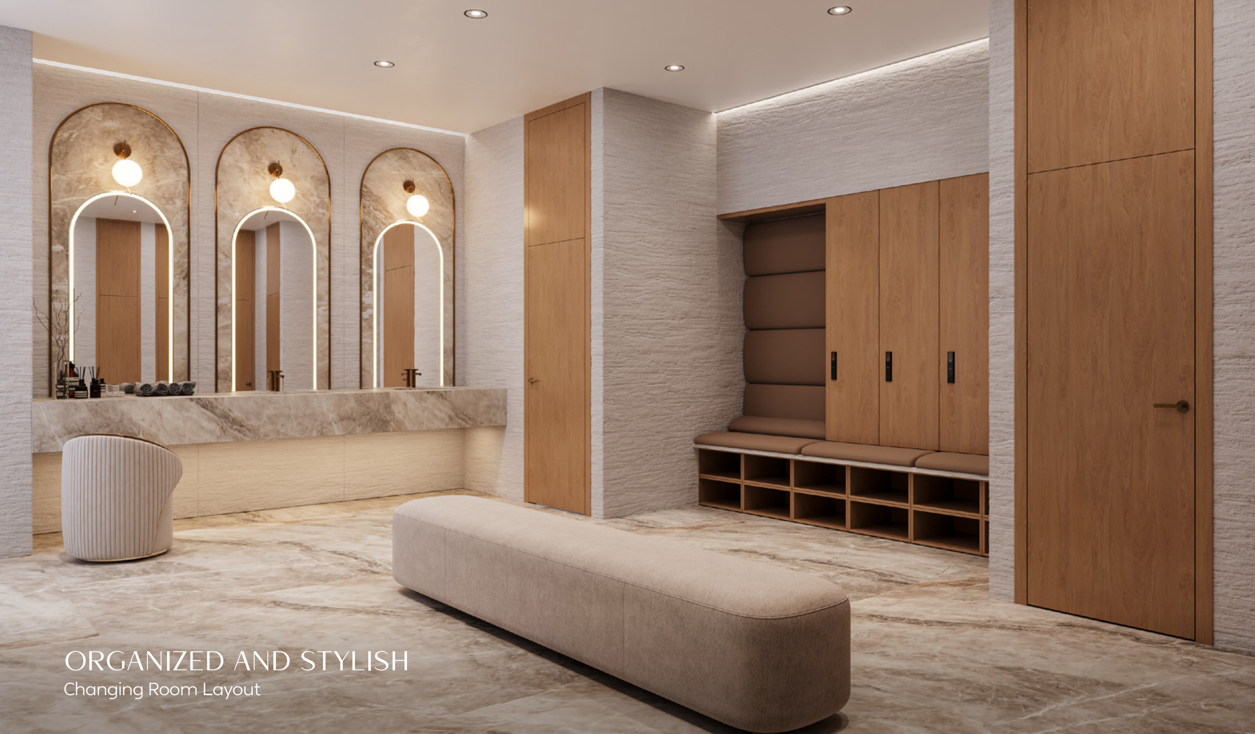
ORGANIZED AND STYLISH Changing Room Layout