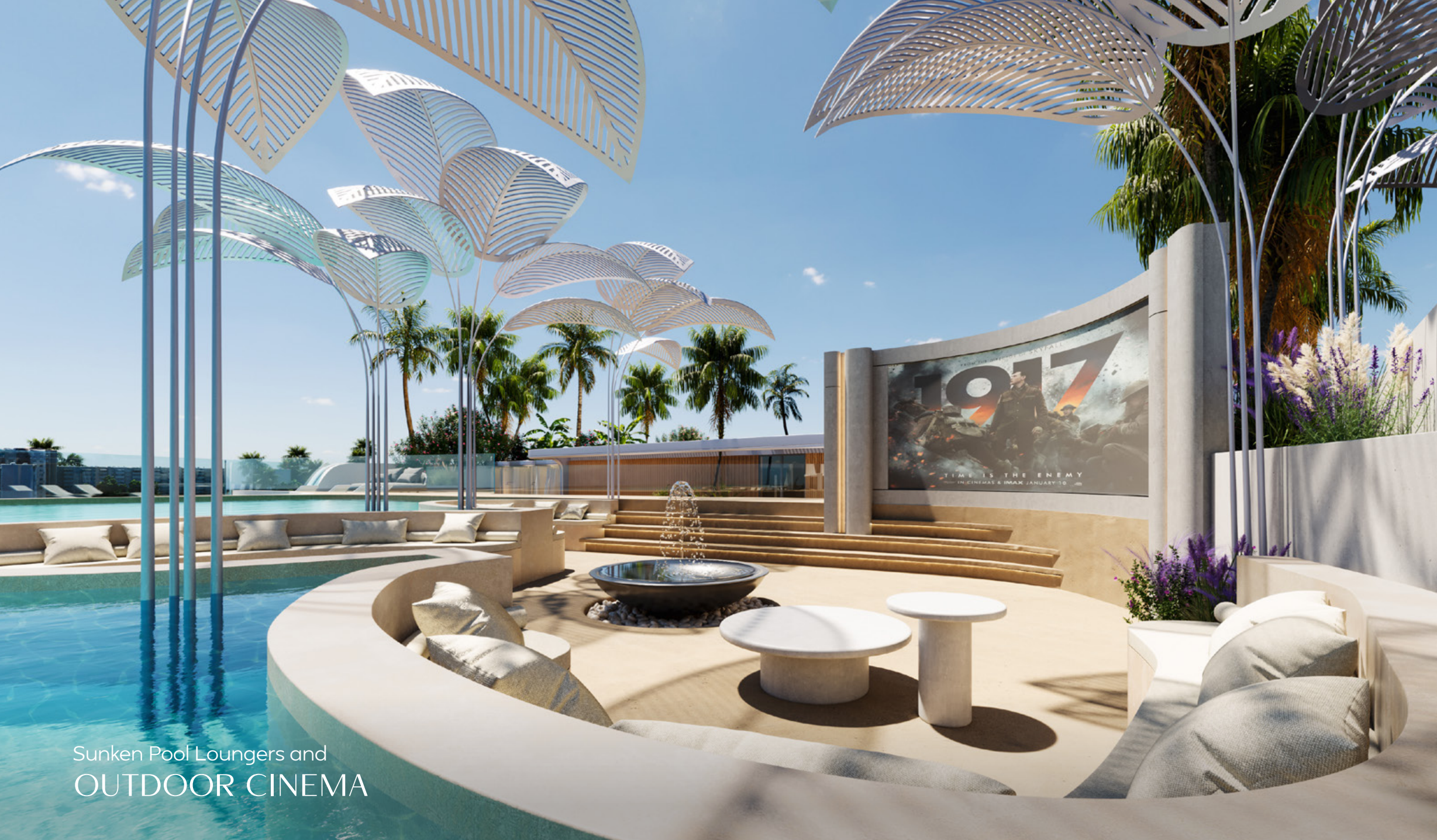
Sunken Pool Loungers and OUTDOOR CINEMA