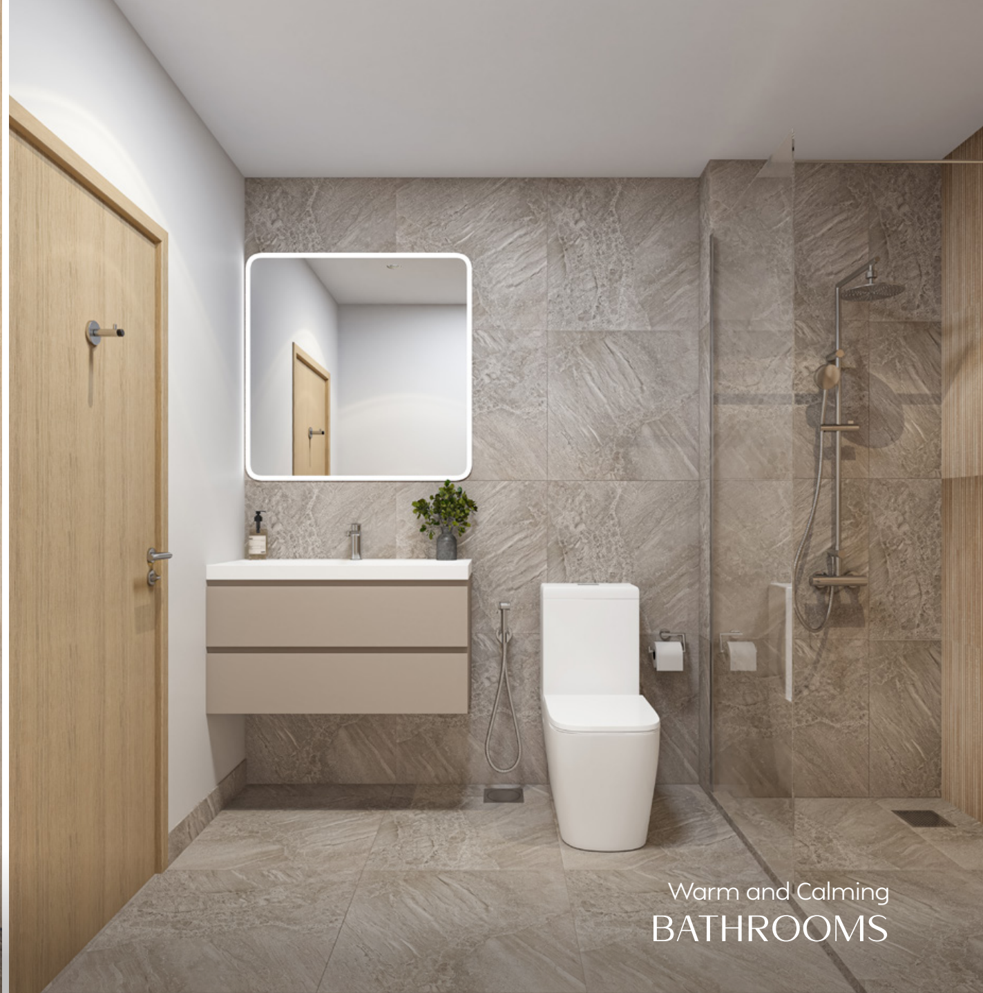
Warm and Calming BATHROOMS