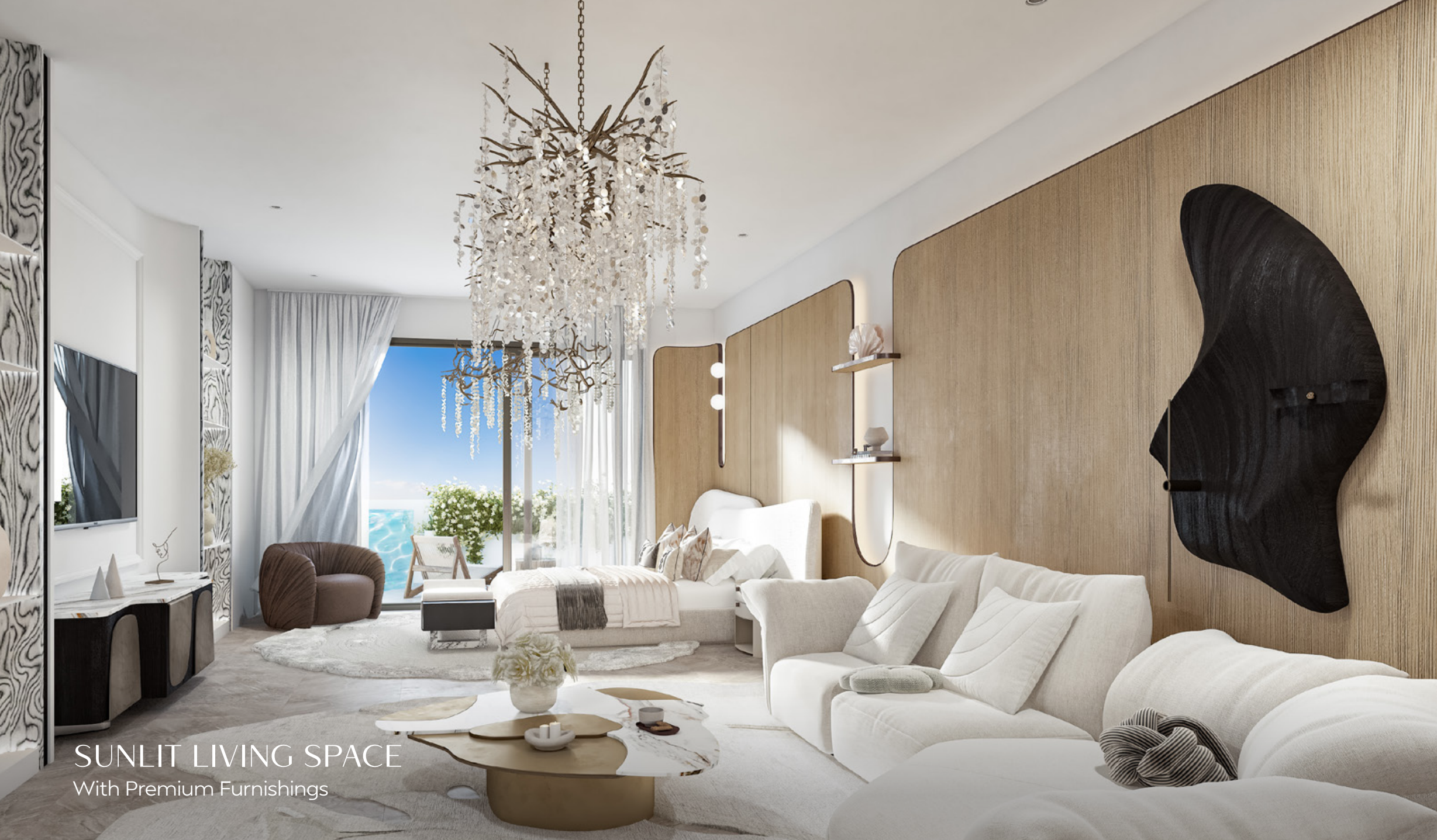
SUNLIT LIVING SPACE With Premium Furnishings