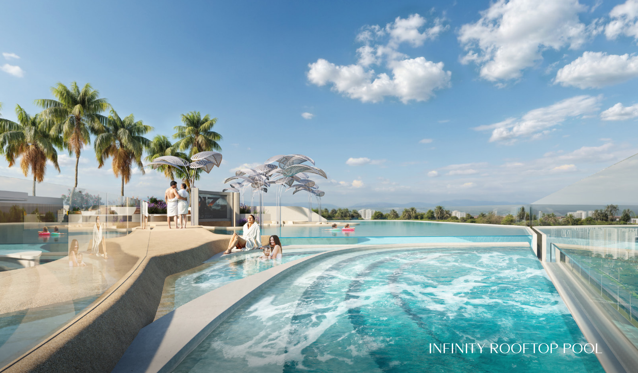
INFINITY ROOFTOP POOL