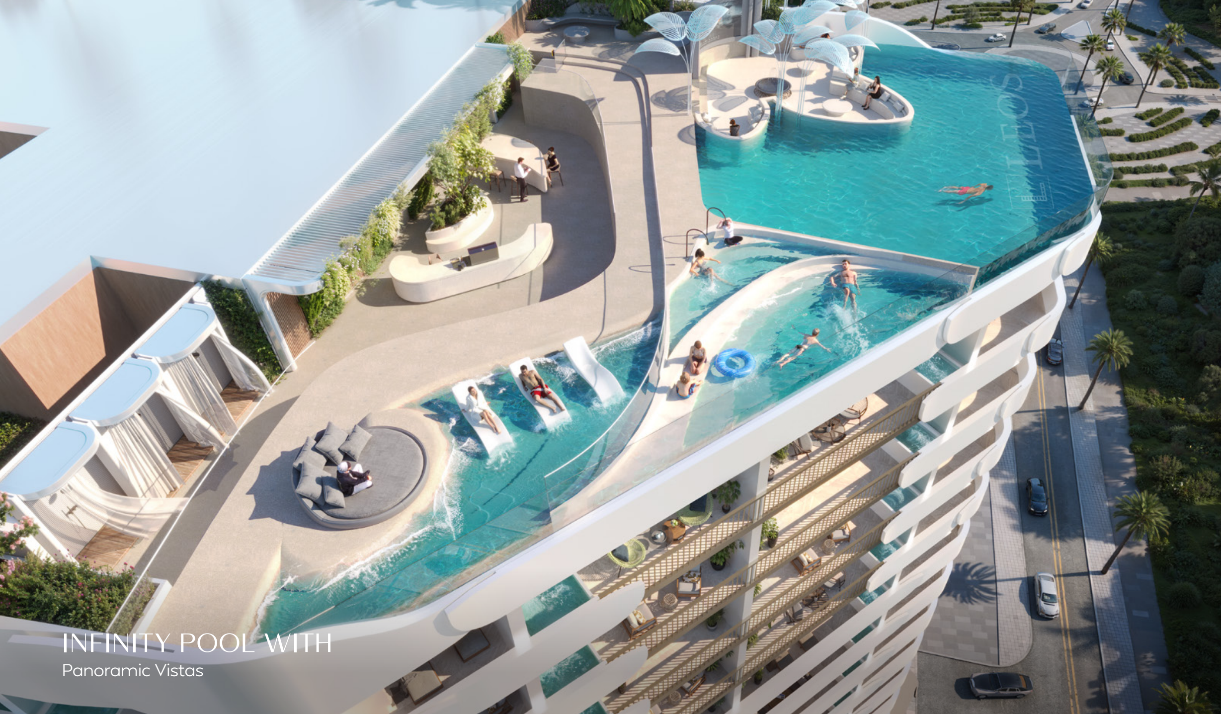
INFINITY POOL WITH Panoramic Vistas