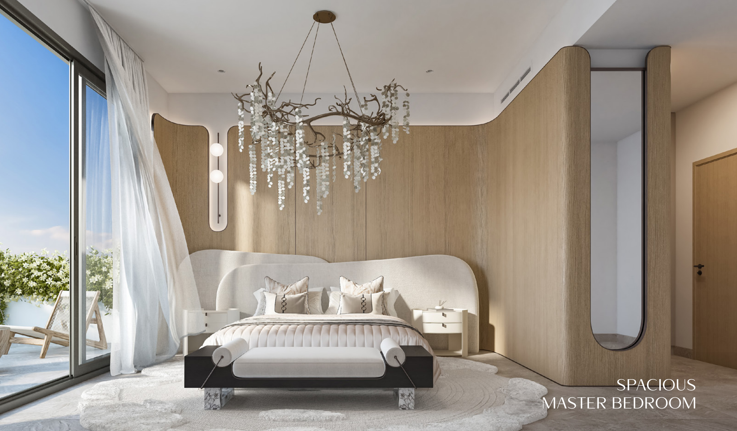
SPACIOUS MASTER BEDROOM