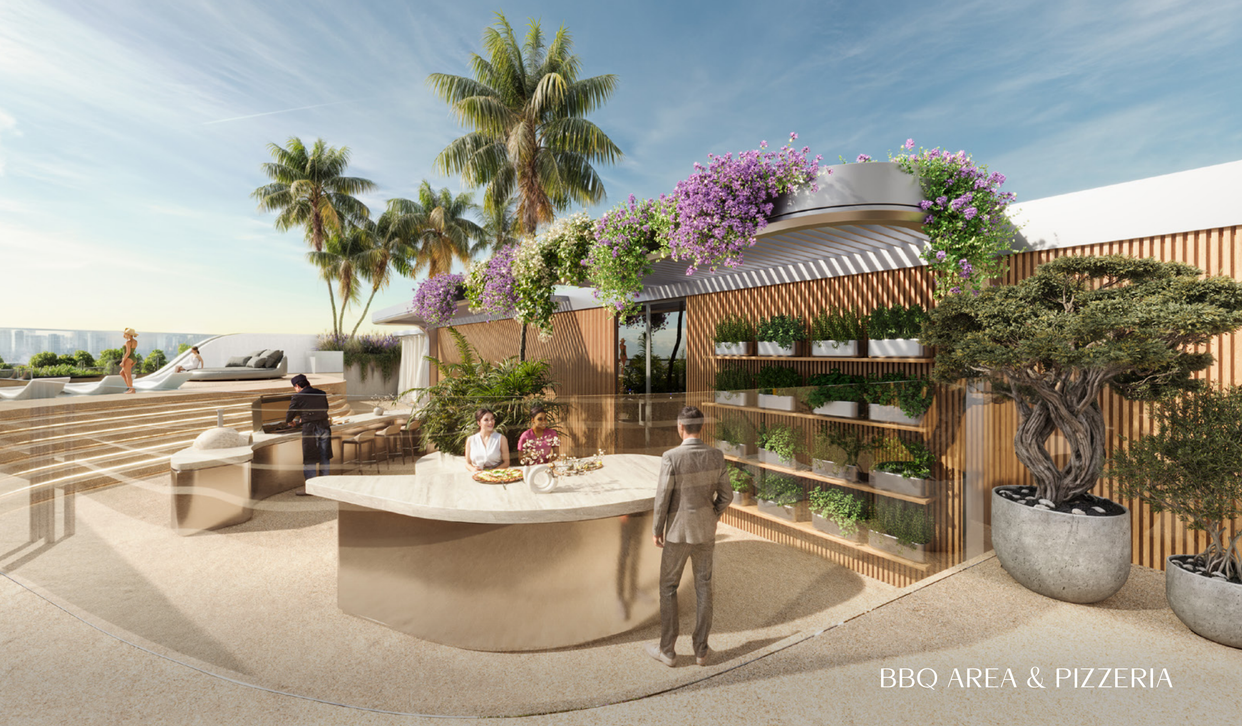
BBQ AREA & PIZZERIA