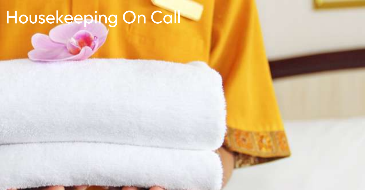
Housekeeping On Call