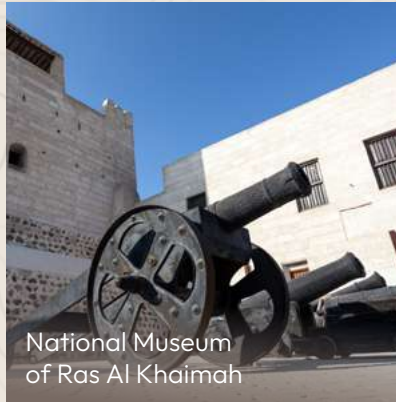
National Museum of Ras Al Khaimah