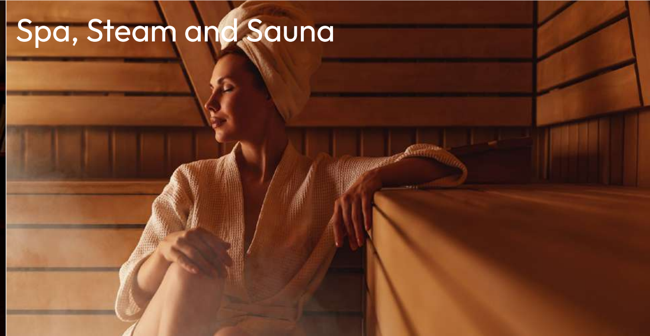
Spa, Steam and Sauna