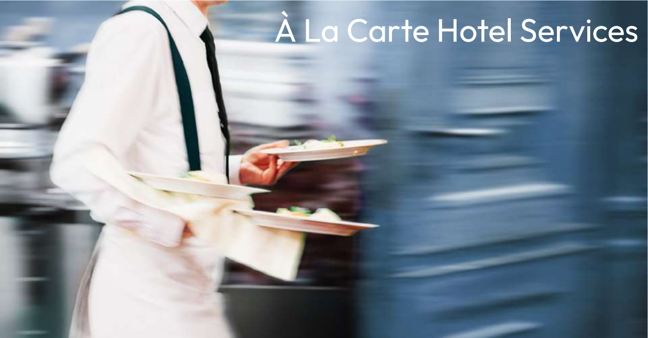
À La Carte Hotel Services