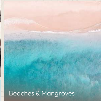
Beaches & Mangroves