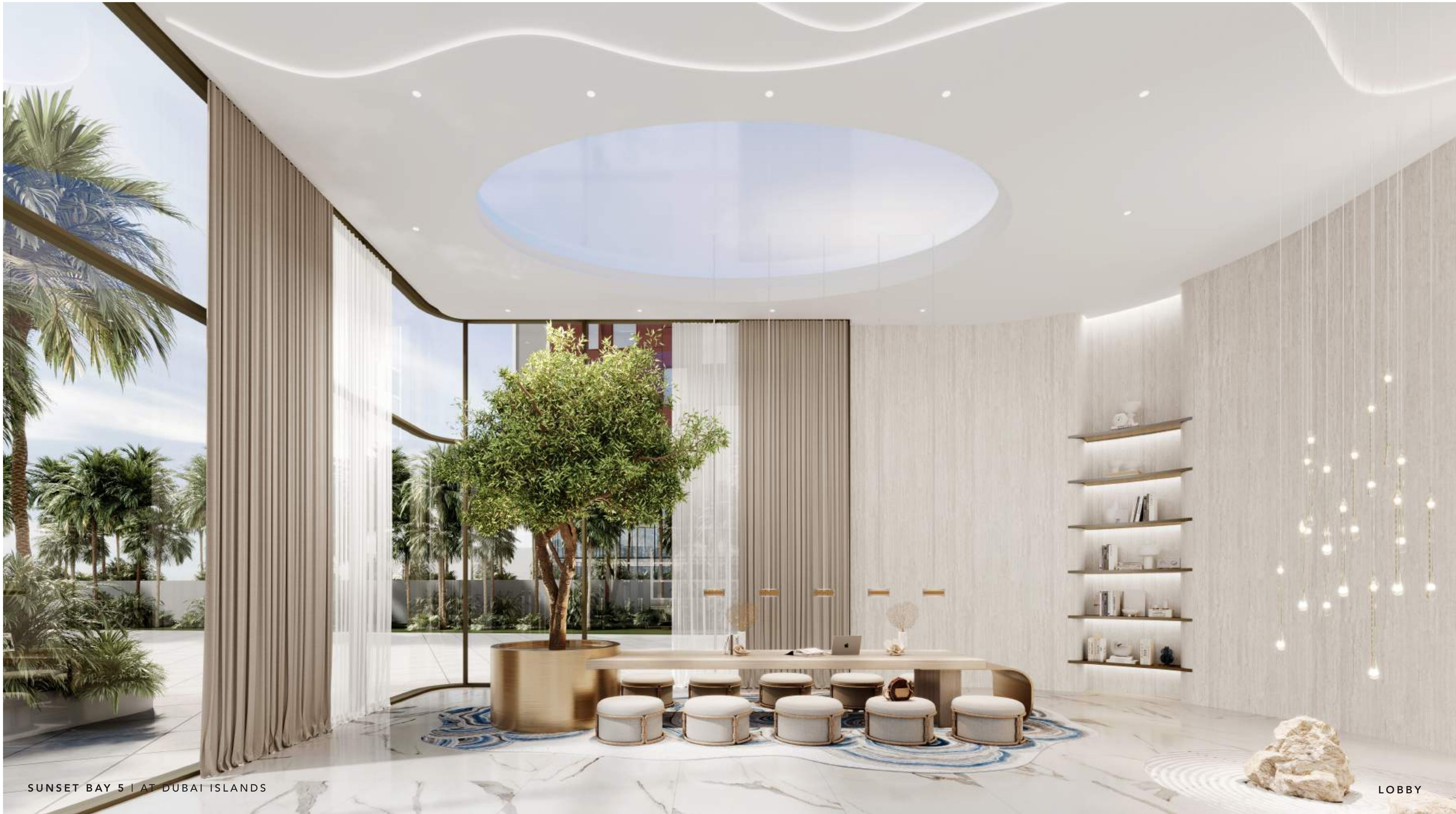
SUNSET BAY 5 | AT DUBAI ISLANDS