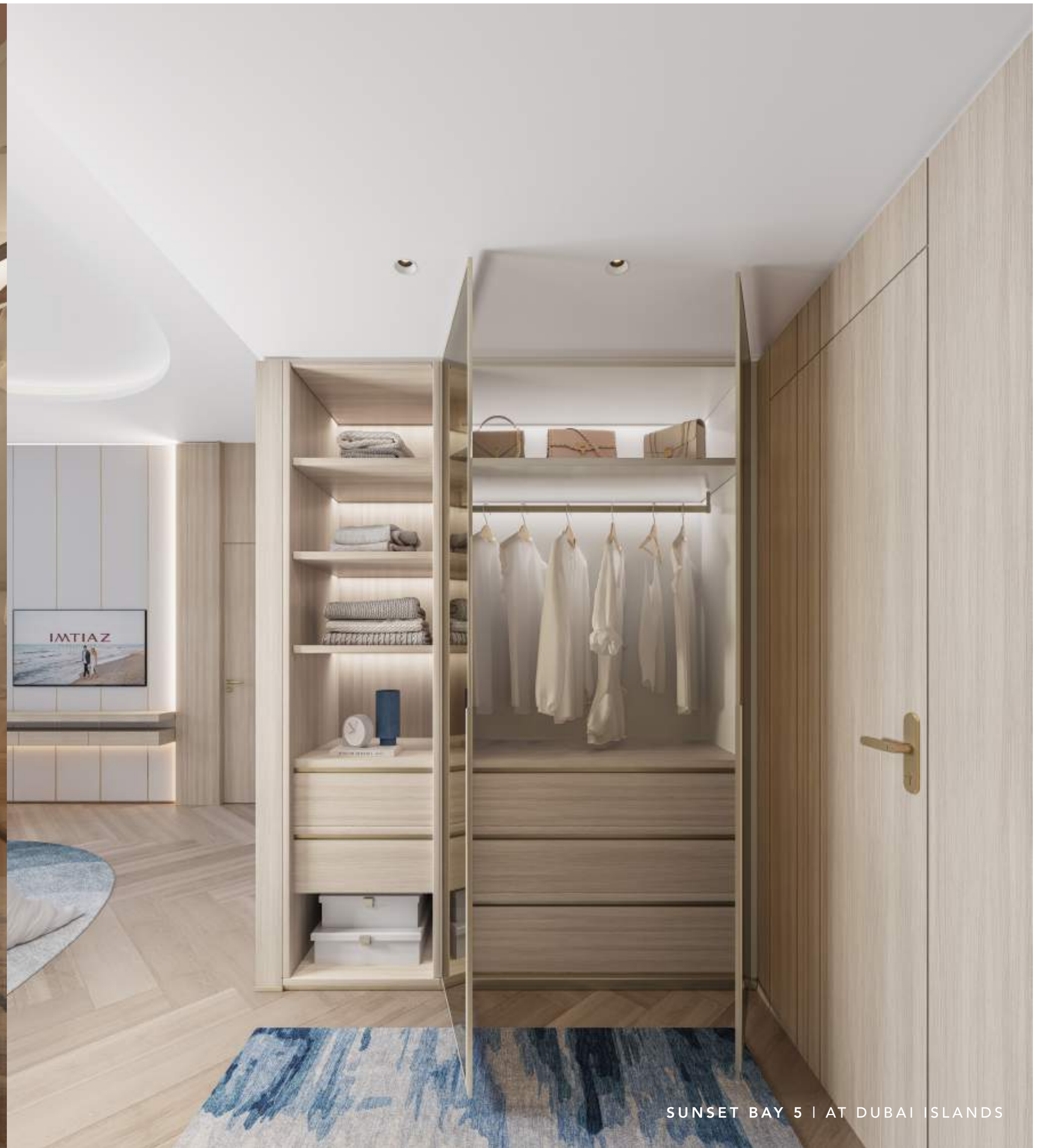
SUNSET BAY 5 | AT DUBAI ISLANDS