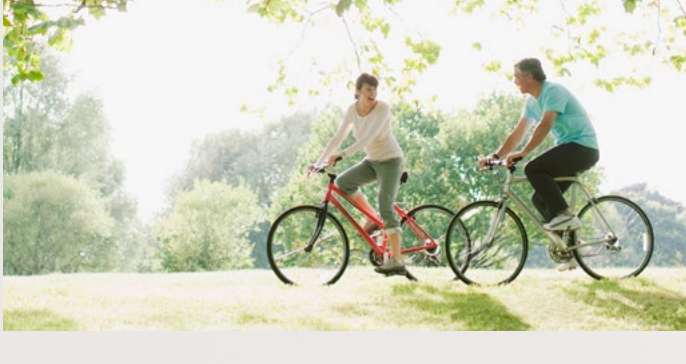
Jogging & Cycling Tracks