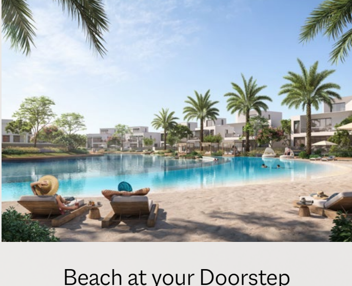
Beach at your Doorstep