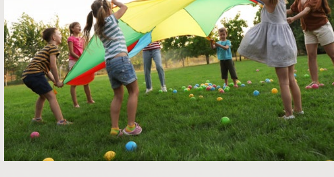
Community Parks & Playgrounds