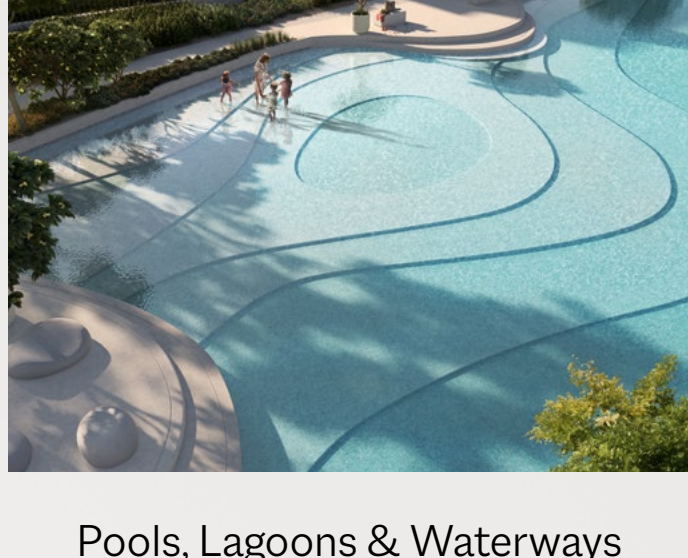
Pools, Lagoons & Waterways