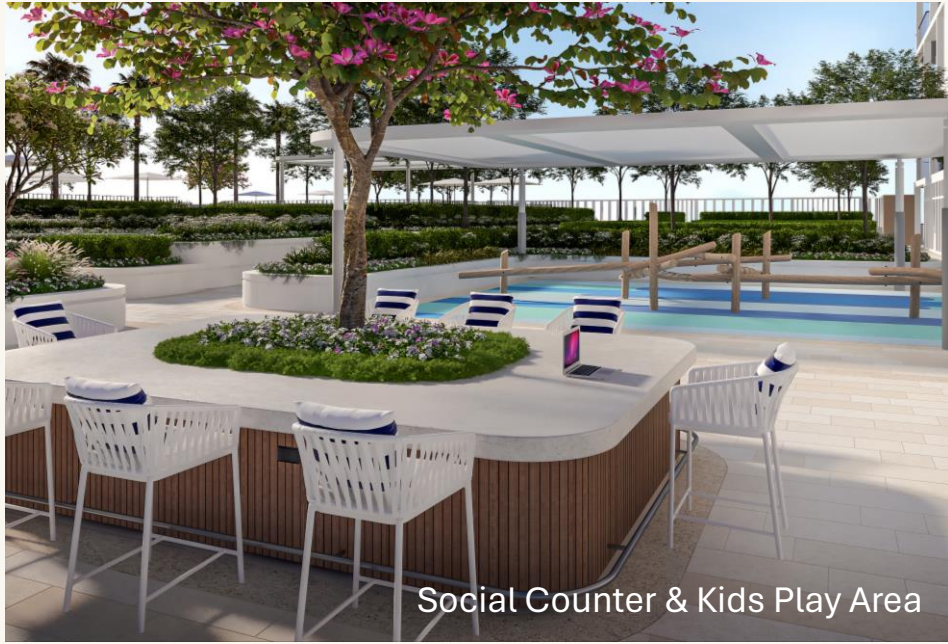
Social Counter & Kids Play Area